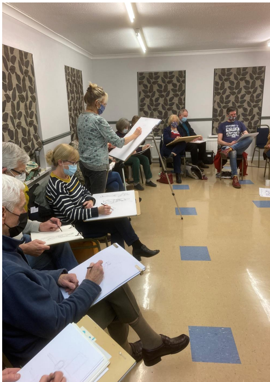
The session in full swing.

In January and March 2022, as part of the theme of 'human forms', we were lucky enough to be visited by an experienced life model. We were guided through attempting to capture various poses by our resident professional artist.